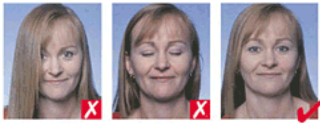
hair across eyes