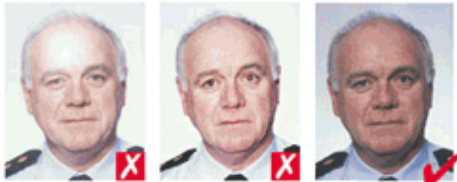
flash reflection on skin