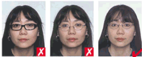
frames too heavy