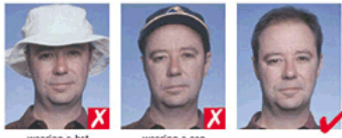
wearing a hat