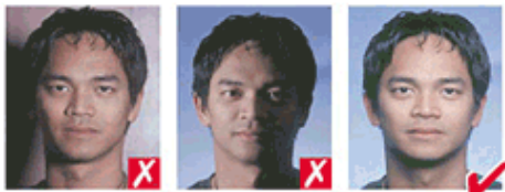
shadows behind head