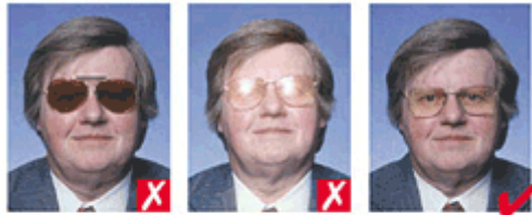
dark tinted lenses