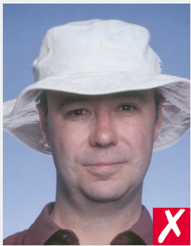
wearing a hat