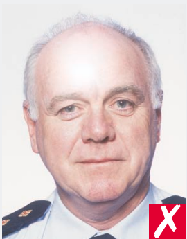
flash reflection on skin