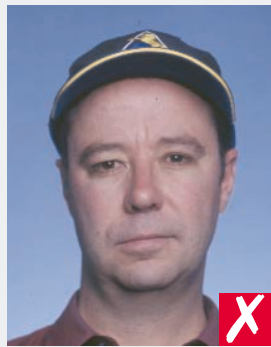
wearing a cap